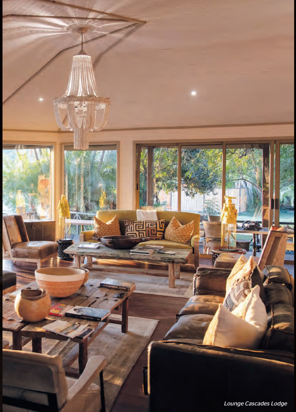
Lounge Cascades Lodge