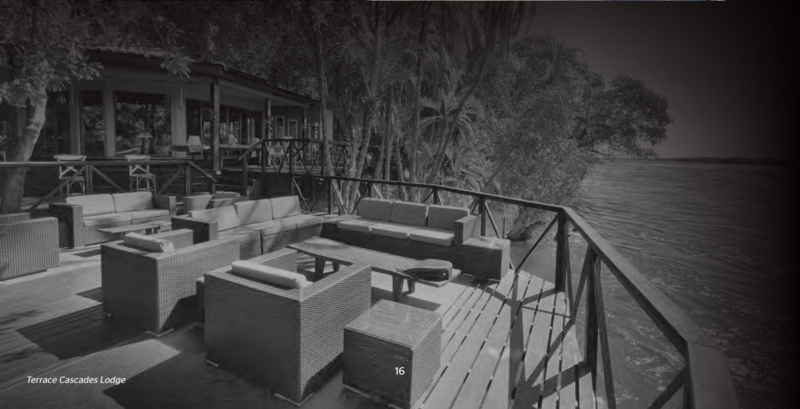
Terrace Cascades Lodge