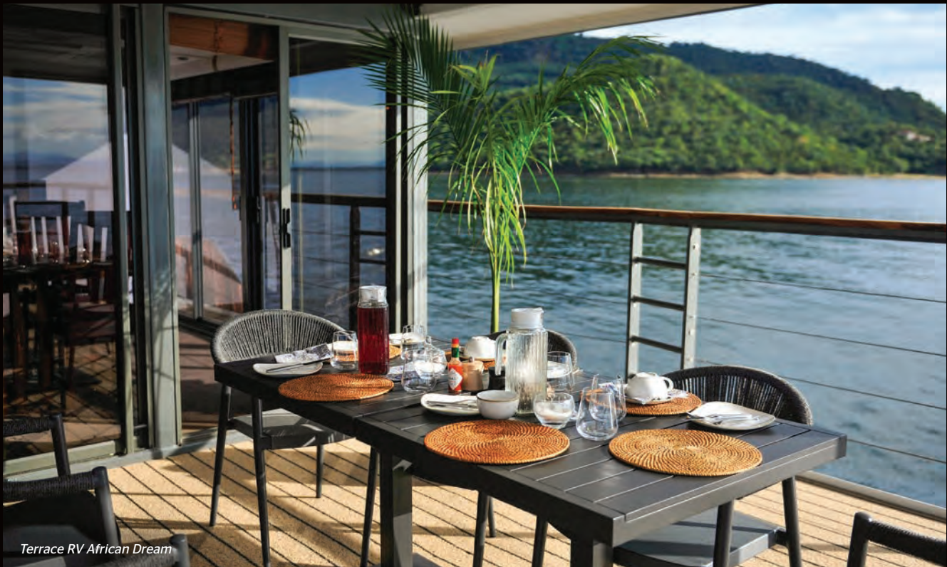
Terrace RV African Dream