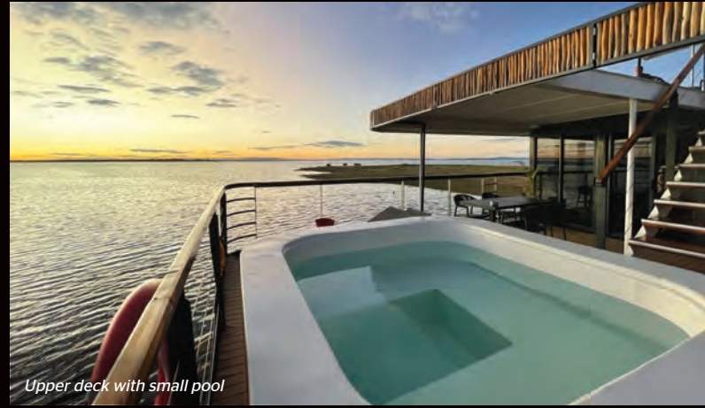
Upper deck with small pool