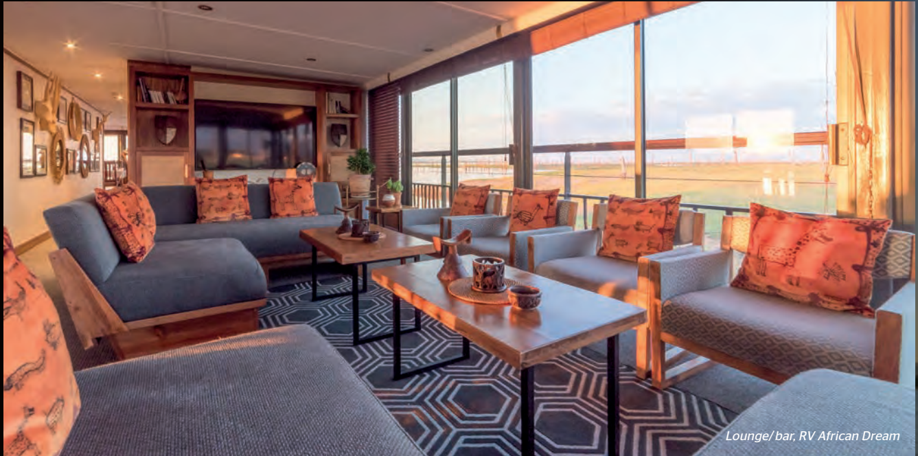
Lounge/bar, RV African Dream