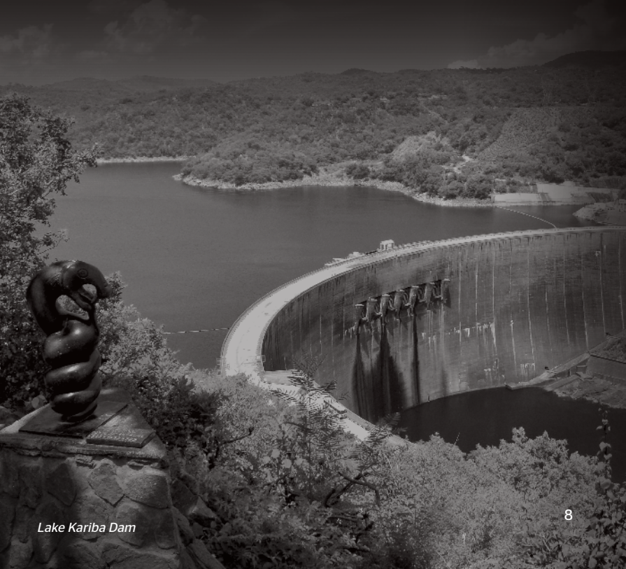
Lake Kariba Dam

Although many people still evoke his presence as a spirit, he is nowadays considered a protector of the lake and its inhabitants.